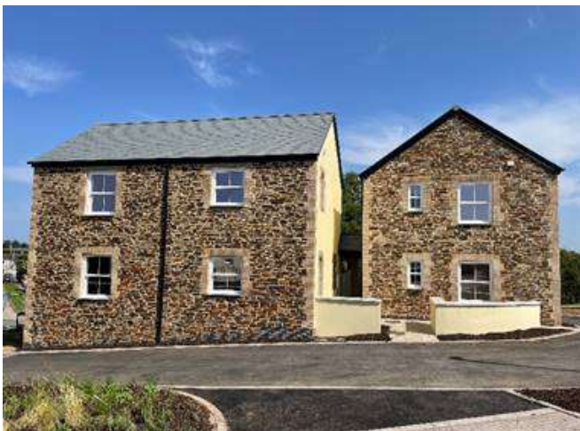
The Affordable Housing Team

Welcome to the first edition of the Affordable Housing Newsletter. Each edition will provide you with a feature article about various Affordable Housing matters; answers to Frequently Asked Questions and provide helpful links. We hope you find it informative.