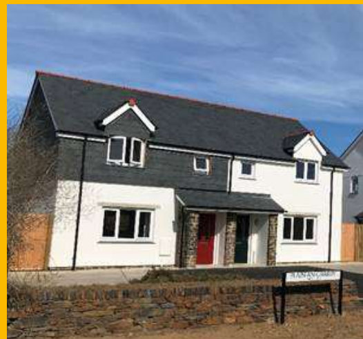
Did you know...